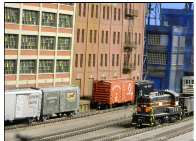
Major industries in Jersey City, NJ include left to right; American Can Company, Dixon Ticonderoga and Renwick Saltpeter.