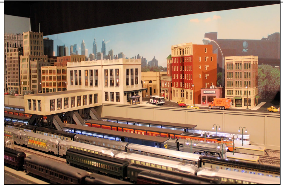
Two photos of the HO scale Burlington County Model RR Club at the Foot lighters Playhouse above.