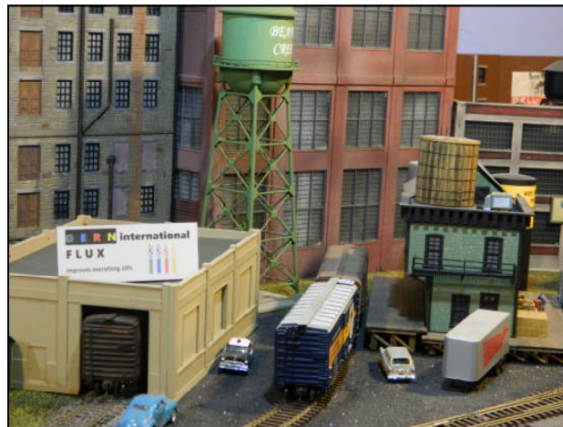
A view of the Harrison, NJ area industries showing left to right; GERN INTERNATIONAL and Wee Beans food cannery.