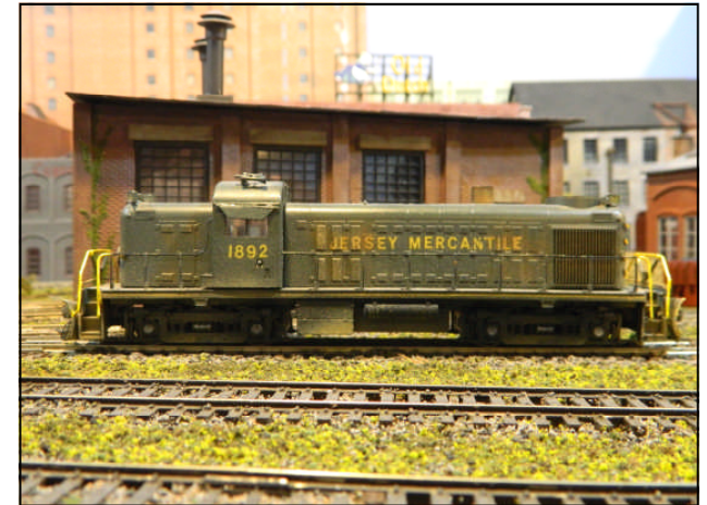
Locomotive 1892 is an ALCO RS2 which has the fuel filler cap on the side of the cab (seen under the 92 numbers. This is a Kato model.