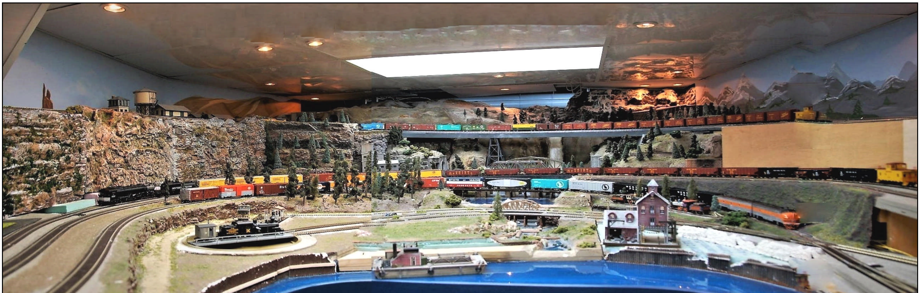
Chuck O Malley provided the photo below, a “panoramic photo” of an area on his Layout.