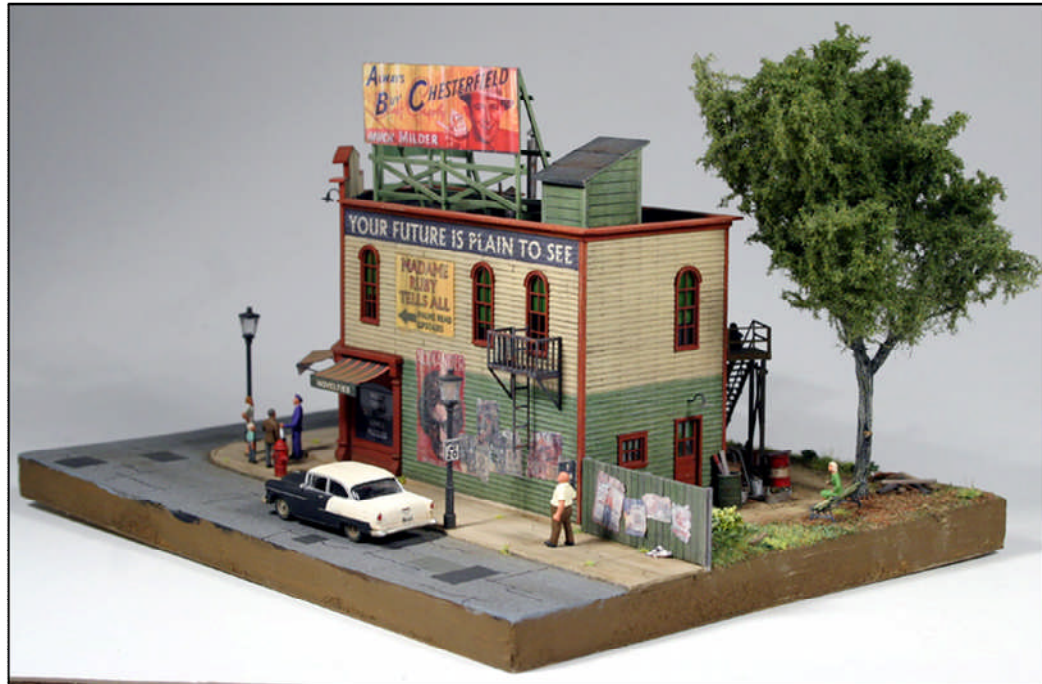
The diorama to the left was constructed by a railroad modeler using a kit from Foscale with a lot of details added.