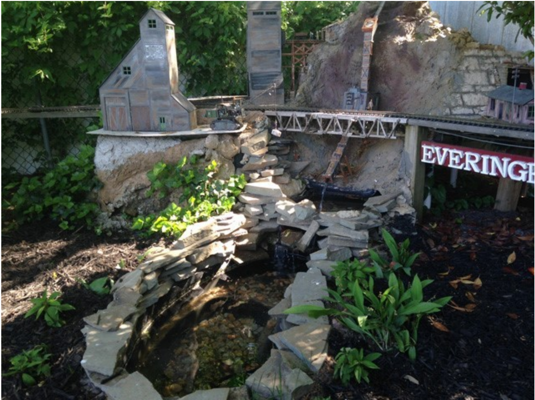
Jules Heiliczzer invites us into a landscaped world.