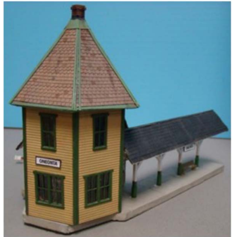
Above: Oneonta Station by Joe Calderone Below: Joe Zebrowski's Yard Office