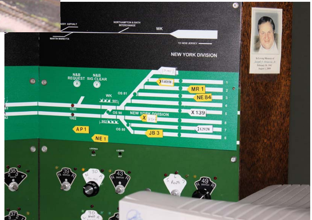
Right: Part of Ralph's CTC panel