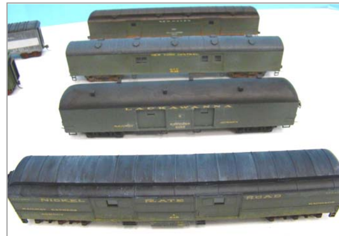
Tom King, 9 modified, kitbashed, painted, & detailed models to represent the prototypes.