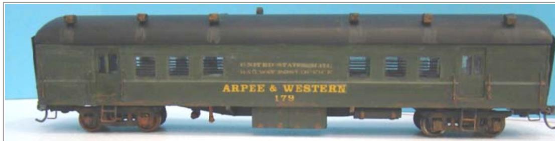
Dick Genthner, Arpee & Western #179 RPO, Walther's Kit from the 1960's with Custom Decals