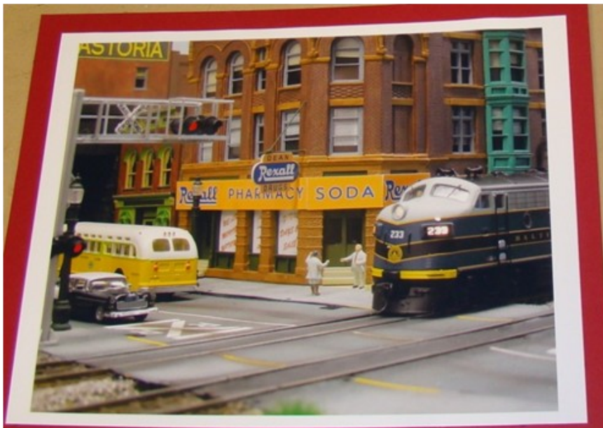
ABOVE — Tom Griffiths Winning Model Photo