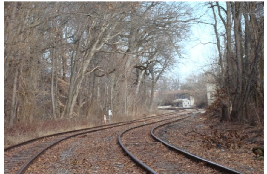
ABOVE — Bill Grosse's Winning Prototype Photo